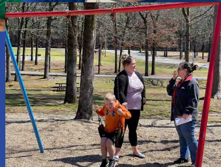
@Hands & Voices 2022